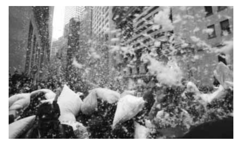
Pillow fight on Wall Street, organized by Newmindspace in 2009. The widely circulated invitation read simply: "Bring a pillow to Wall St & Broad St at 3:00pm. Dress in business suits, demand your bailout."

A flash mob is an unrehearsed, spontaneous, contagious, and dispersed mass action. Flash mobs first emerged in 2003 as a form of participatory performance art, with groups of people using email, blogs, text messages, and Twitter to arrange to meet and perform some kind of playful activity in a public location.<sup>1</sup> More recently, activists have begun to harness the political potential of flash mobs for organizing spontaneous mass actions on short notice.