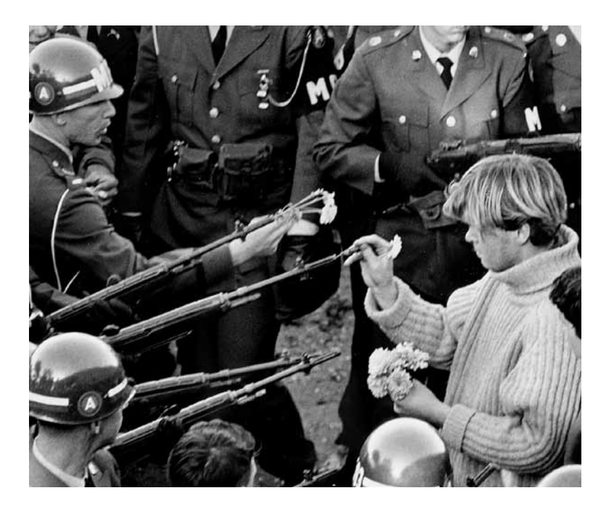
The Yippies used the symbolic power of flowers in this emancipatory spectacle. Flower Power, 1967, The Washington Evening Star photo by Bernie Boston.

Progressives tend to distrust anything that smacks of propaganda or marketing — that's what the other side does. We tend to believe that proclaiming the naked Truth is enough: "Ye shall know the truth, and the truth shall set you free." But waiting for the truth to set us free is lazy politics. The truth does not reveal itself by virtue of being the truth: it must be told, and told well. It must have stories woven around it, works of art made about it; it must be communicated in new and compelling ways that can be passed from person to person, even if this requires flights of fancy and new mythologies. The argument here is not for a progressive movement that deceives or cheapens its message but rather for a propaganda of the truth. This is the work of ethical spectacle.