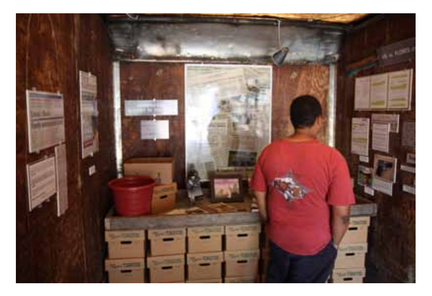
A man tours the inside of the box truck that houses the Florida Modern-Day Slavery Museum.

tool, reminding attendees of their own capacity for social change and the indispensable role they could play alongside farmworkers in transforming the food system.