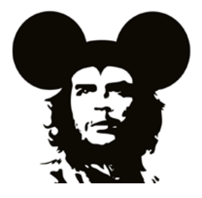
This mashup of two iconic images captures the tensions and contradictions of the ethical spectacle.

The concept of ethical spectacle offers a way of thinking about the tactical and strategic use of signs, symbols, myths, and fantasies to advance progressive, democratic goals. First introduced in a 2004 article by Andrew Boyd and Stephen Duncombe and later expanded in Duncombe's 2007 book Dream, the theory's premises are: (1) that politics is as much an affair of desire and fantasy as it is reason and