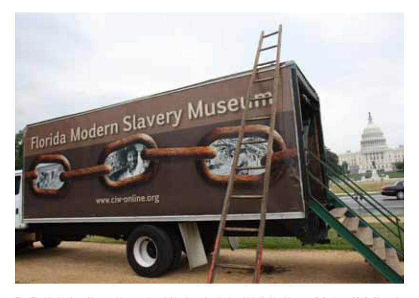
The Florida Modern Slavery Museum is exhibited on the National Mall, Washington, D.C., June 2010.

academic authorities on slavery and labor history in Florida.